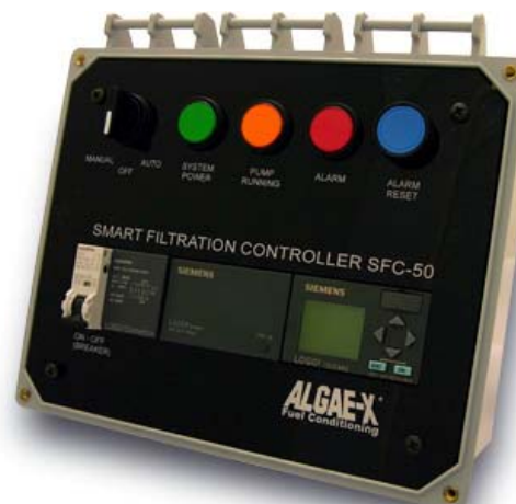
SFC-50 Smart Filtration Controller

Digital flow meter, Rotor Sight Glass, Foot Valve AFC-705 Fuel Catalyst