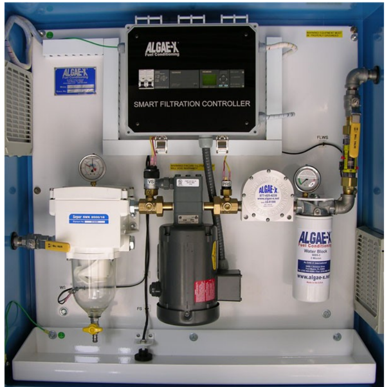
Inside view STS 6000-4GPM-S

STS 6000 Accessories: AFC-705 Fuel Catalyst, Wide range of filter elements, Rotor Sight Glass, Foot Valve, Separ Primary Filter, Two tank control, Digital flow meter