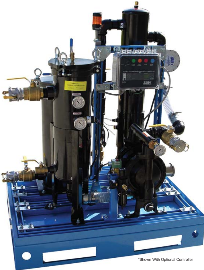
*Shown With Optional Controller

AXI's mobile tank cleaning systems excel in combining High Capacity Filtration & Water Separation with Compact Design and Low Operating Cost to provide Optimal Fuel Quality for Peak Engine Performance and Reliability.